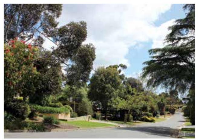
Woodforde and Morialta have their own distinct character – in stark contrast to most of Campbelltown.