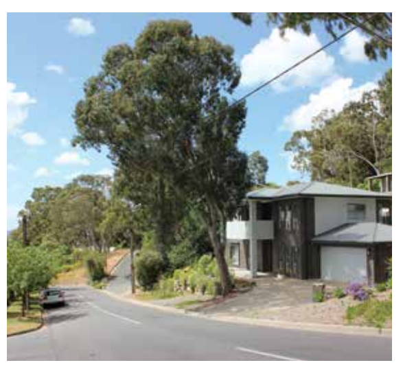
Quiet, tree-lined streets of Woodforde, with elevated views out to the city and Gulf – perfect targets for infill and still more development.